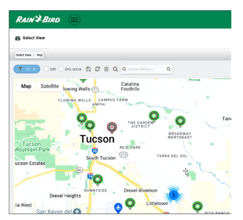
Map/Satellite or list views enable you to see the locations of all your pumps

No need to run to your pump house when you have Rain Bird MCA. Access all your pump stations through one dashboard.