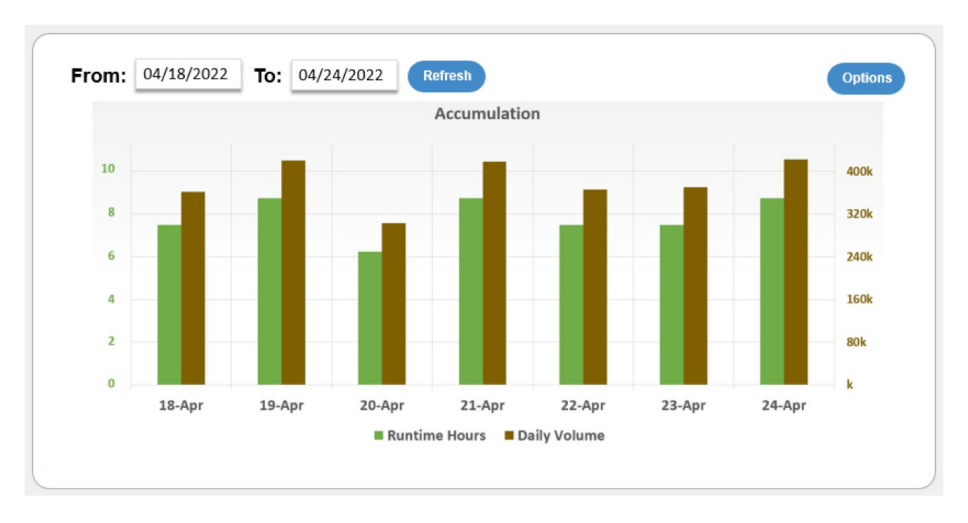
Quickly monitor and track runtime and applied volume

Rain Bird panels with MCA are the intelligent solution for those with aged controls looking to upgrade to the latest golf pump station control.